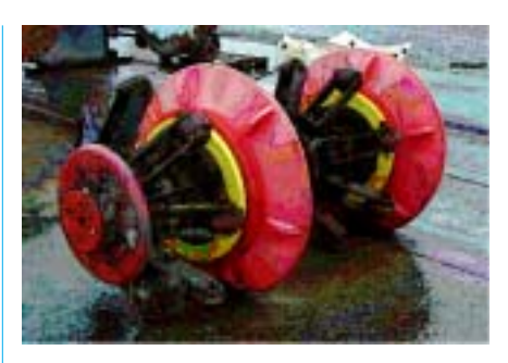
Fig.2. The Asgard pig.

Pipeline tools fitted with CMSS offer a high degree of repeatability with regard to running on the centreline, and this performance is even maintained when negotiating pipeline features such as small-diameter bends. 'Nose diving' due to the weight of the pig when running horizontally can be a problem in long dry pipeline runs: the force generated by the