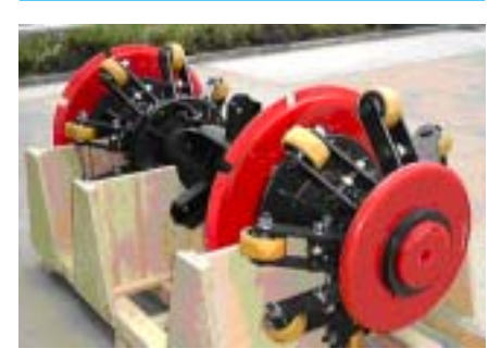
Fig.3. Pipeline cleaning pig, before...