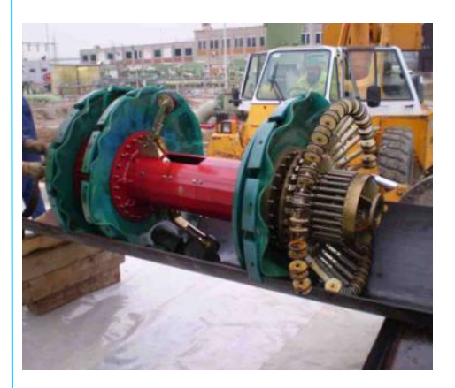
PSI's Multi- channel inspection tool

PSI are preparing an inspection tool with 50 Channels and separate sensing arms for a High Resolution Multi-Channel inspection of the 56" pipeline for the Opal Project.