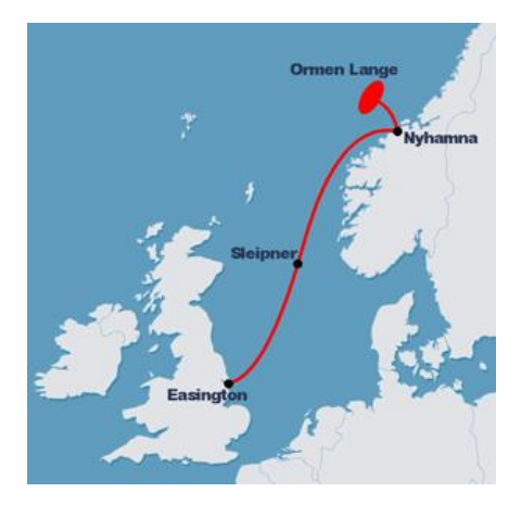
Route of Langeled Pipeline, the world's longest subsea gas pipeline

With a total length of 1173 km, Langeled Pipeline connecting Nyhamna in Norway and Easington in Great Britain is the world's longest subsea gas pipeline. In 2008, ROSEN was awarded the contract for a single-run in-line inspection of the pipeline. No pipeline of comparable length had been inspected in a single run before.