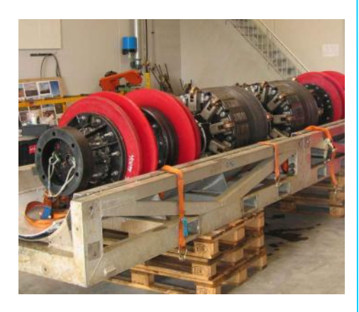
TDW to use its SmartPlug® isolation tool

TDW used its SmartPlug isolation tool to isolate the section of the line that required a new valve.