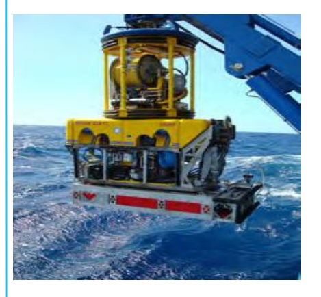
Denizen remote subsea technology

Situated in the Deepwater Tano and West Cape Three Points blocks, the